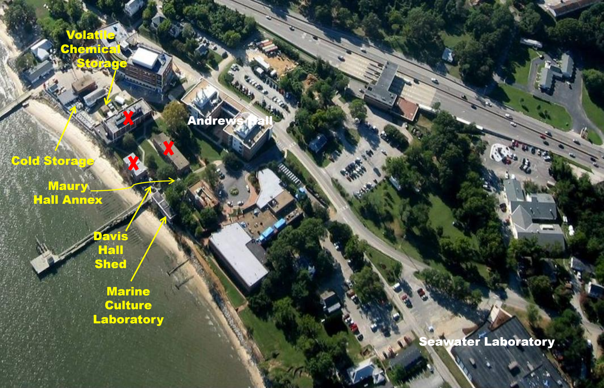
VIMS Resolution 4 to Demolish five small buildings: Marine Culture Laboratory, Maury Hall Annex, Cold Storage, Volatile (Chemical) Storage, and the Davis Hall shed