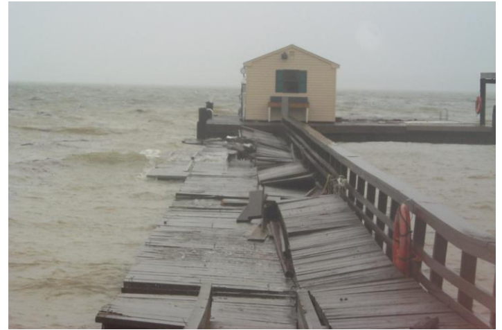
Immediately After the Storm