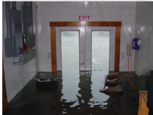
Hatchery Front Door