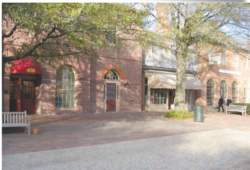
IRENE ROJAS + THE FLAT HAT A romantic walk down DoG street (day or night) is the best first date with a special someone.