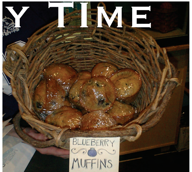
LAUREN PUTNOCKY + THE FLAT HAT

It's hard to make time for breakfast, especially if you have an early-morning class. While one of the ubiquitous campus vending machines may be a tempting option for a last-minute morning meal, it is not a reliable source of sustenance and offers little in the way of nutrition. Just because you can eat candy for breakfast doesn't mean you should. And the snack selection is hit-and-miss anyway; half the time the only things left are Extra-Spicy Hot Fries and those nasty cookies with the chewy fruit blobs in the center. — kt