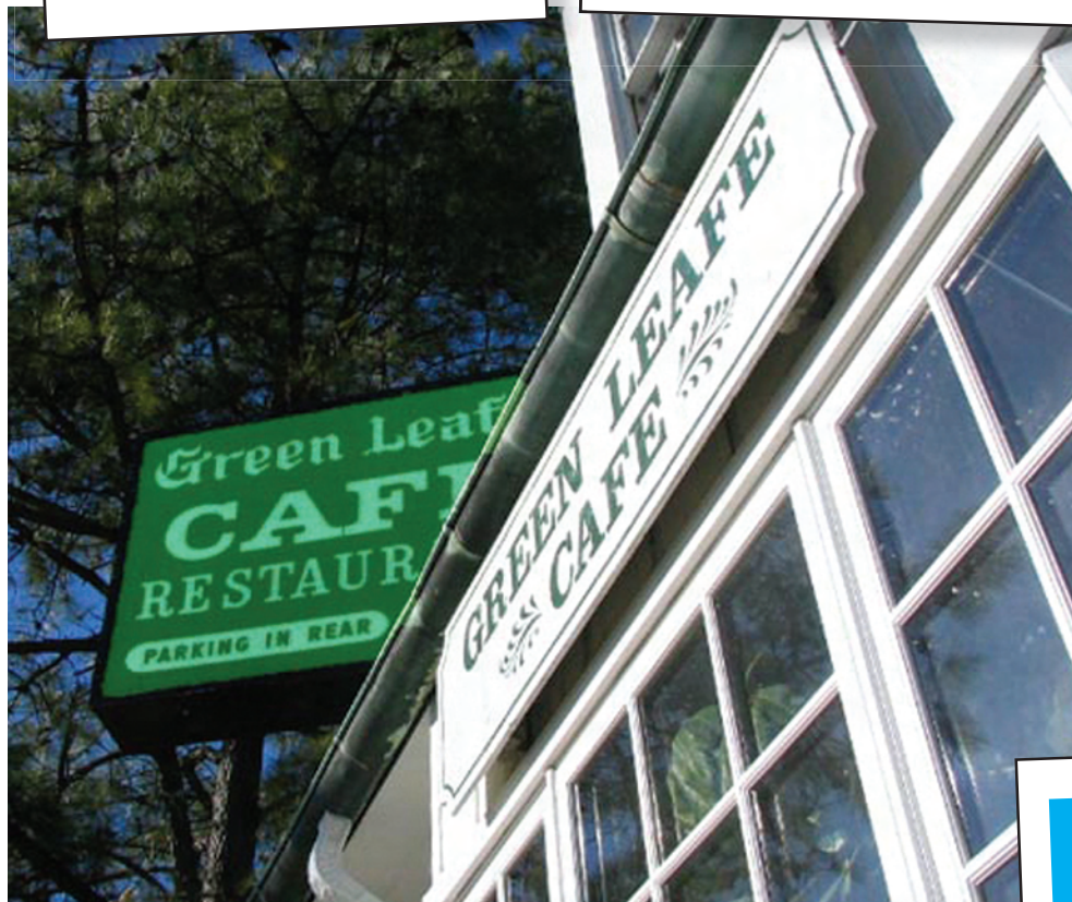
LIZZY SPENCER + THE FLAT HAT

The Green Leaf Cafe: Not just for students anymore. Have your parents take you there and try out something other than that cheap stuff you fill your mug with Sunday nights.