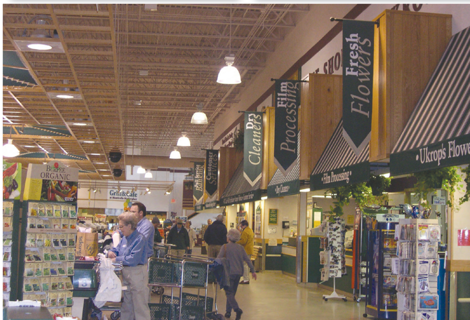
LAUREN BRYANT + THE FLAT HAT

Ukrop's Super Markets are well known for their friendly customer service. They are the only grocery store in Williamsburg that will bring your groceries out to your car for you.