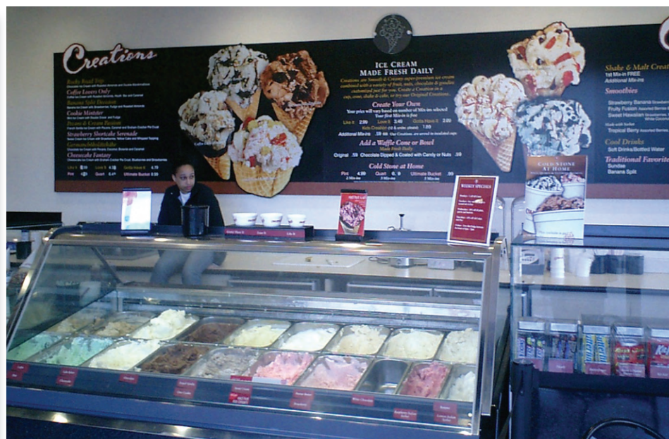
LAUREN PUTNOCKY + THE FLAT HAT

To indulge a cool sweet tooth, no place hits the spot better than newly-opened Cold Stone Creamery . With 16 base flavors and over 30 mix-ins, Cold Stone allows customers to concoct their very own creations. If experimenting with the nearly endless combinations has you a little weary, pick from one of their ready-made flavors like “At the Cocoa Banana Cabana” and “Banana Spit Decision.” However, words of caution — no matter how big your eyes, restrain yourself to the “Like It” size. It’s sure to fill even the hungriest snacker. — ei