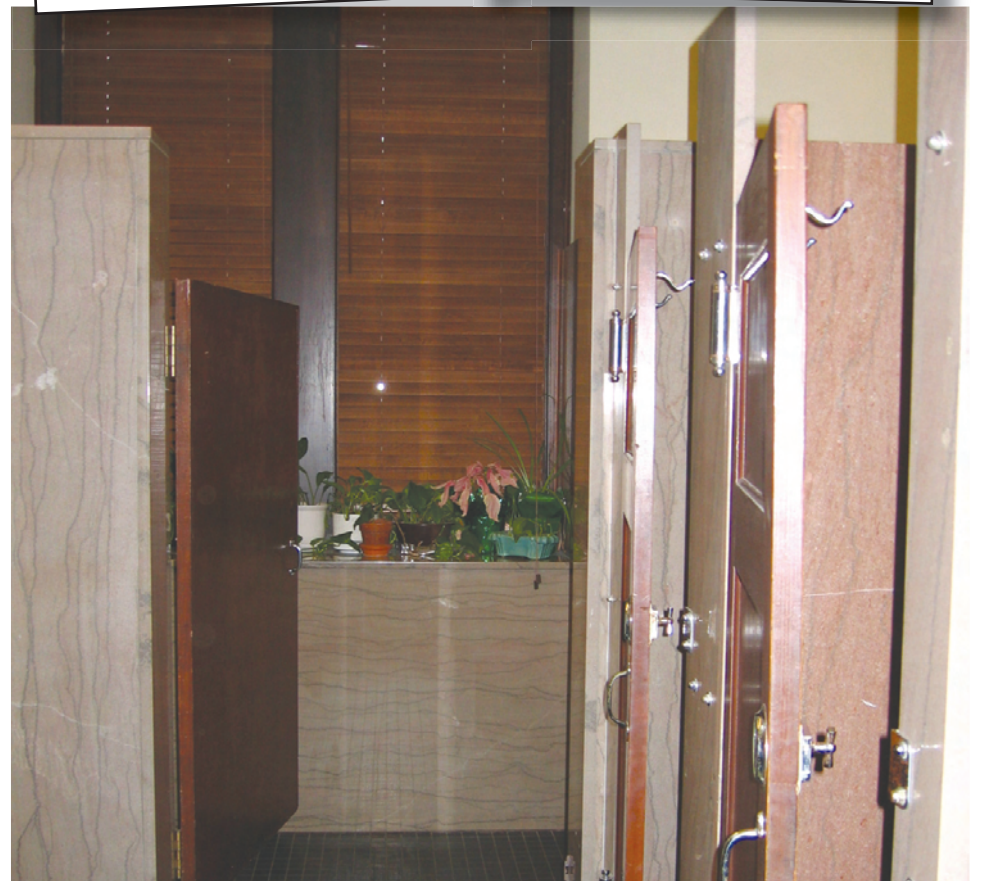
IRENE ROJAS + THE FLAT HAT

The best bathroom on campus is the located in Blair Hall on the first floor. The multitude of plants create a soothing and homey atmosphere atypical of other bathrooms on campus.