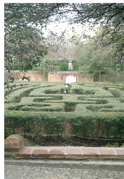
LAUREN PUTNOCKY + THE FLAT HAT Get lost in the crazy maze located behind the Governor's Palace.