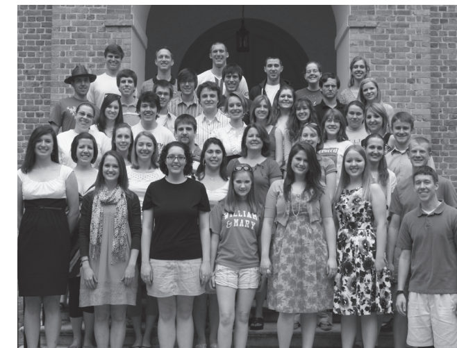
Members of the Baptist Collegiate Ministries gather together before heading into the church. One of BCM's popular services was helping freshmen move into their dorms at the beginning of the year.