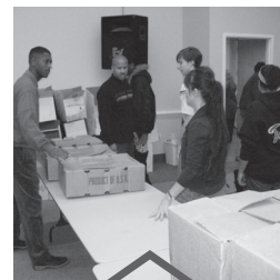
Members of Project ALL help students at the Academy of Life and Learning pack holiday meals for local families in need. The Academy offered an alternative education program for students who were not able to attend public schools.