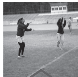
Members of the Women's Ultimate Frisbee team pair up to practice passing to each other. The team played in Richmond, Fredericksburg, and Winston-Salem, North Carolina in the fall.