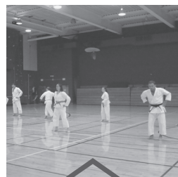
Members of the Shotokan Karate club begin their Thursday night practice in Adair Gym. The club participated each year in the East Coast Shotokan Karate Association Regional Tournament.