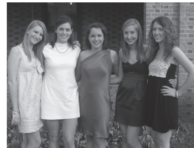
Several members of Chi Omega pose for a picture in front of the Chi Omega house. Wearing white or black set the new members and the seniors apart in order to celebrate their first or last formal respectively.