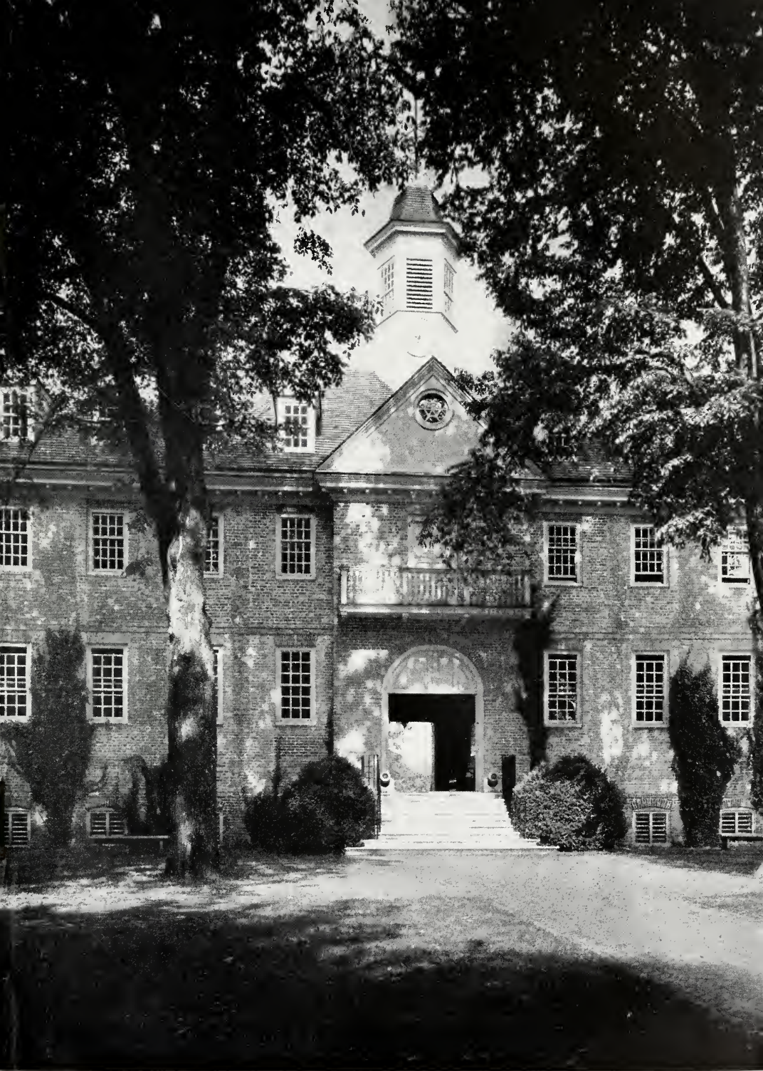
SIR CHRISTOPHER WREN BUILDING, 1695