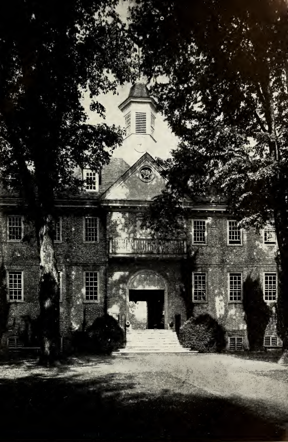
SIR CHRISTOPHER WREN BUILDING, 1695