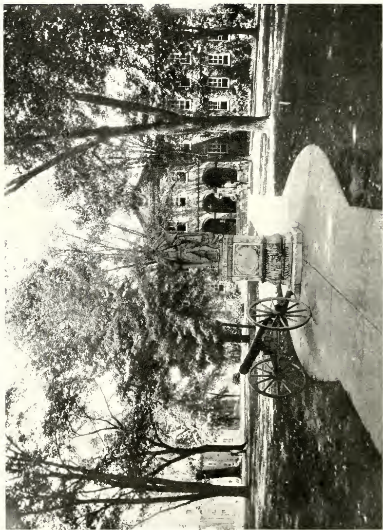
COLLEGE OF WILLIAM AND MARY, MAIN BUILDING