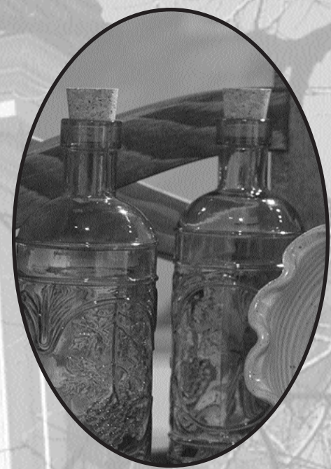
Shop for Mom