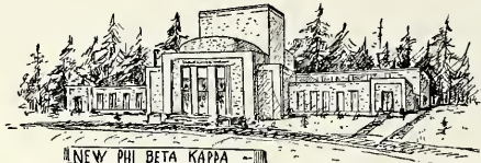
NEW PHI BETA KAPPA