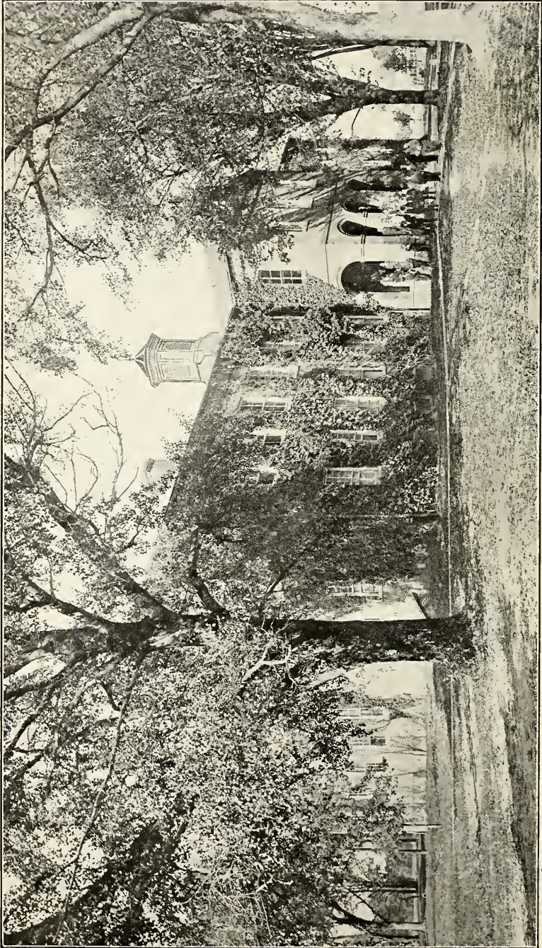
COLLEGE OF WILLIAM AND MARY