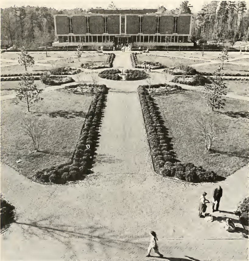
Earl Gregg Swem Library