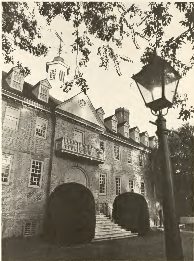
The Sir Christopher Wren Building