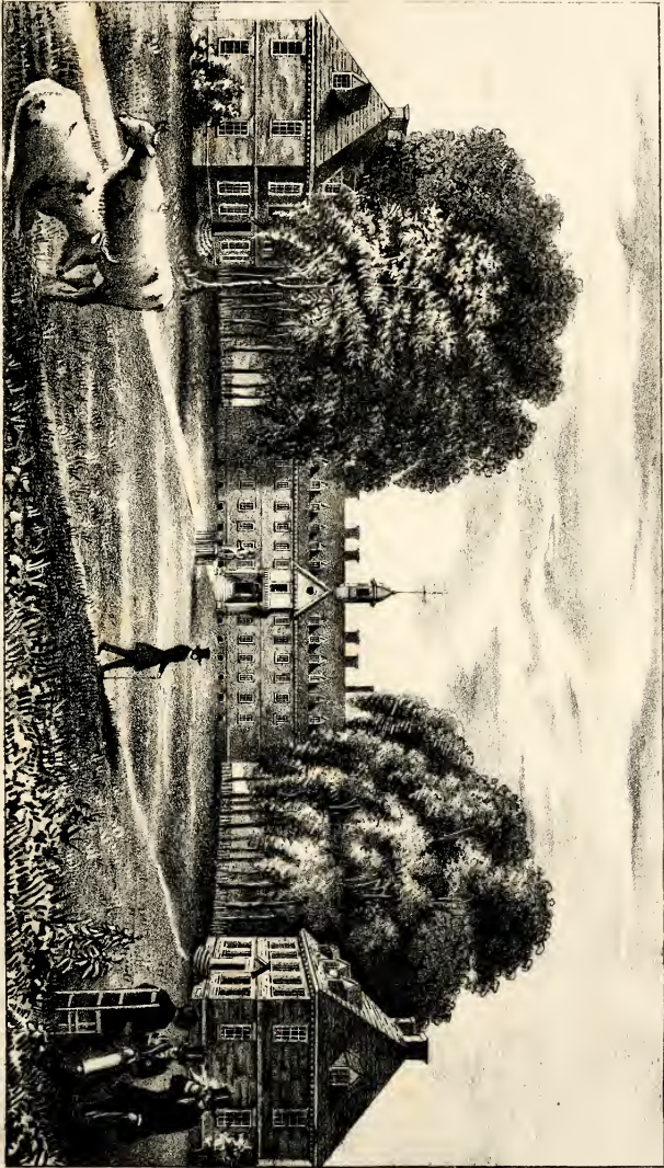
WILLIAM & MARY COLLEGE, WILLIAMSBURG, VA.