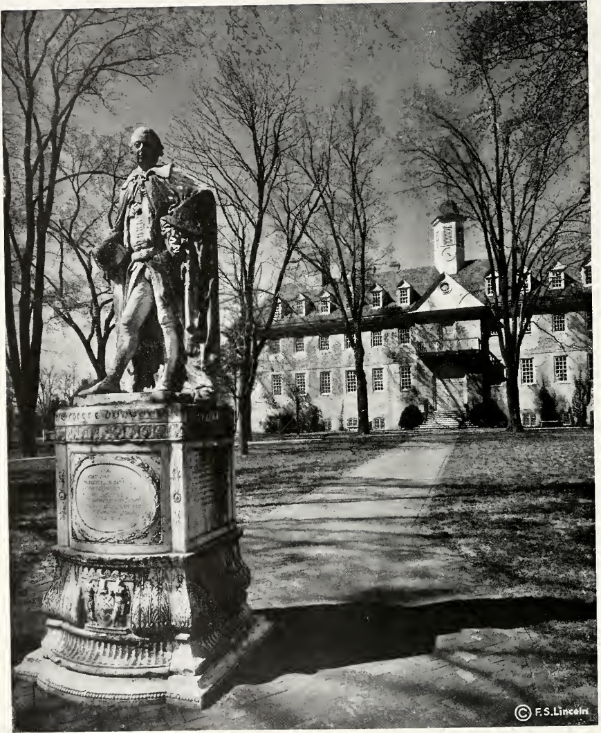
WREN BUILDING—FRONT VIEW SHOWING LORD BOTETOURT'S STATUE