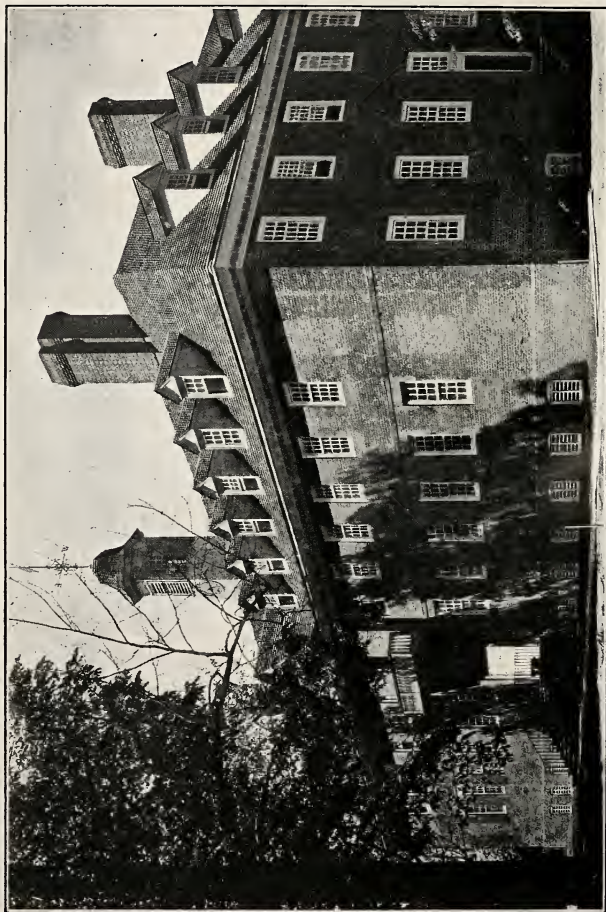
SIR CHRISTOPHER WREN BUILDING