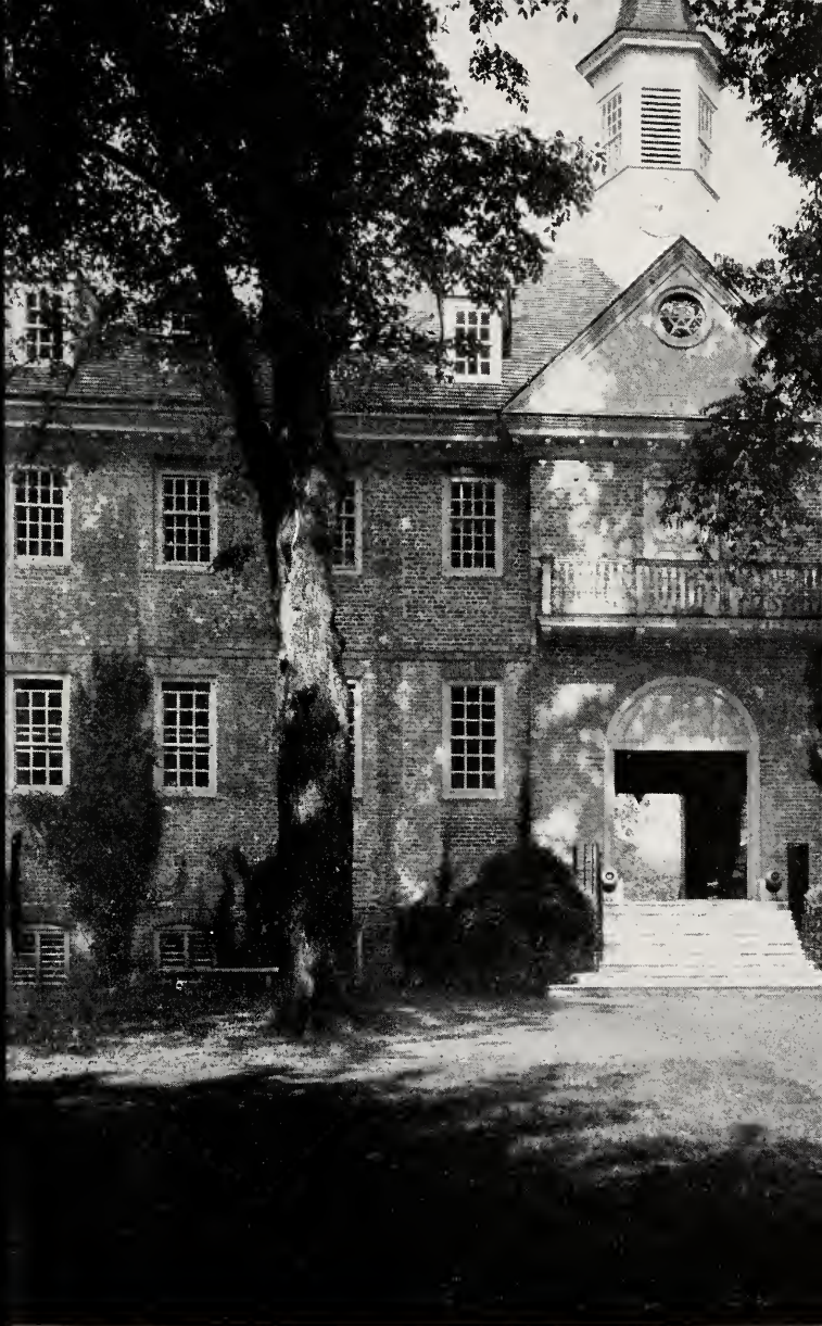
SIR CHRISTOPHER WREN BUILDING,