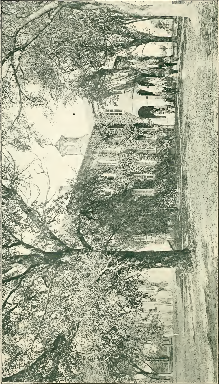
COLLEGE OF WILLIAM AND MARY