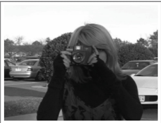
GODARD in Ukrops parking lot?: Well it could be. Video still from French Cinema short film by Eve Grice