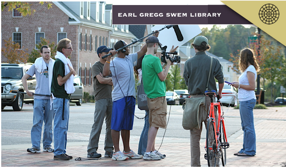
EARL GREGG SWEM LIBRARY