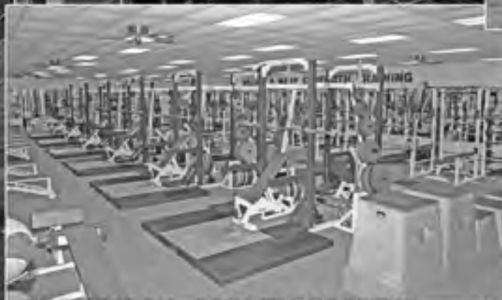
JOSEPH W. MONTGOMERY STRENGTH TRAINING CENTER