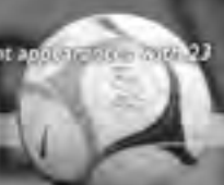
WOMEN'S SOCCER Nine-time CAA Champion Third-most NCAA Tournament appearances with 23