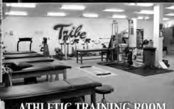
ATHLETIC TRAINING ROOM