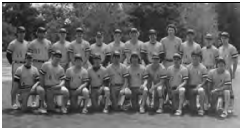
The 1983 team won W&M's first championship in 47 years and became the first team in school history to advance to the NCAA Tournament