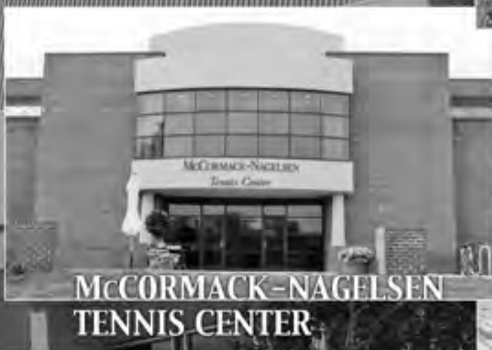
MCCORMACK-NAGELSEN TENNIS CENTER