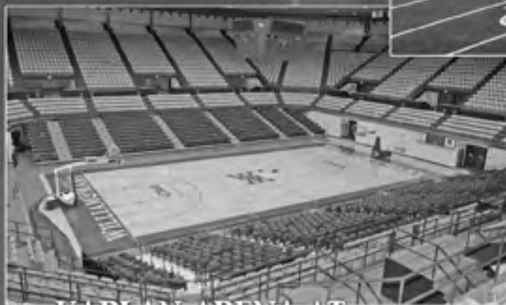
KAPLAN ARENA AT WILLIAM & MARY HALL