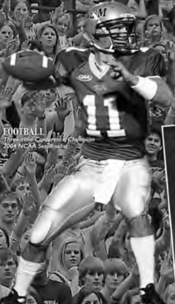
FOOTBALL Three-time Conference Champion 2004 NCAA Semifinalist