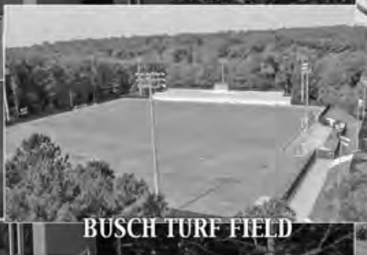
BUSCH TURF FIELD