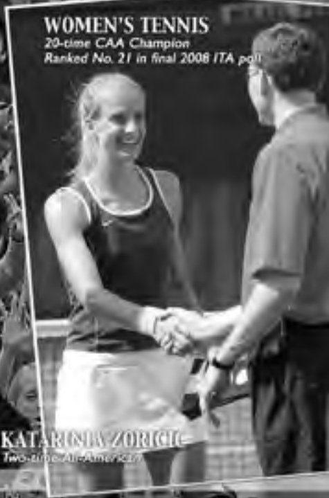
WOMEN'S TENNIS 20-time CAA Champion Ranked No. 21 in final 2008 ITA poll