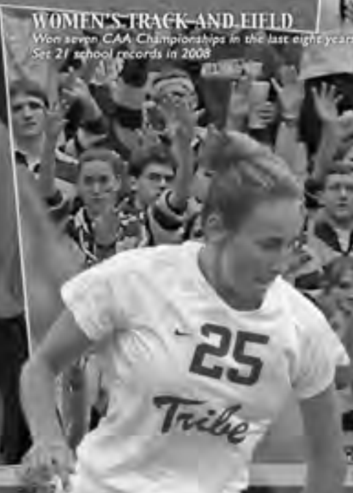
WOMEN'S TRACK AND FIELD Won seven CAA Championships in the last eight years Set 21 school records in 2008