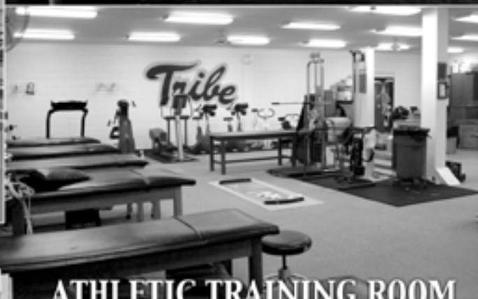
ATHLETIC TRAINING ROOM