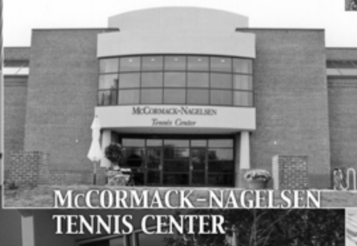
McCORMACK-NAGELSEN TENNIS CENTER