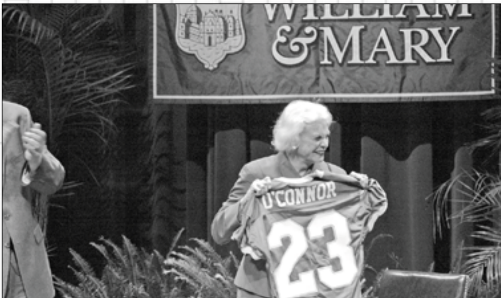
Sandra Day O'Connor was invested as the College's 23rd chancellor on April 7, 2006. At investiture ceremonies, she was presented with a Tribe football jersey.