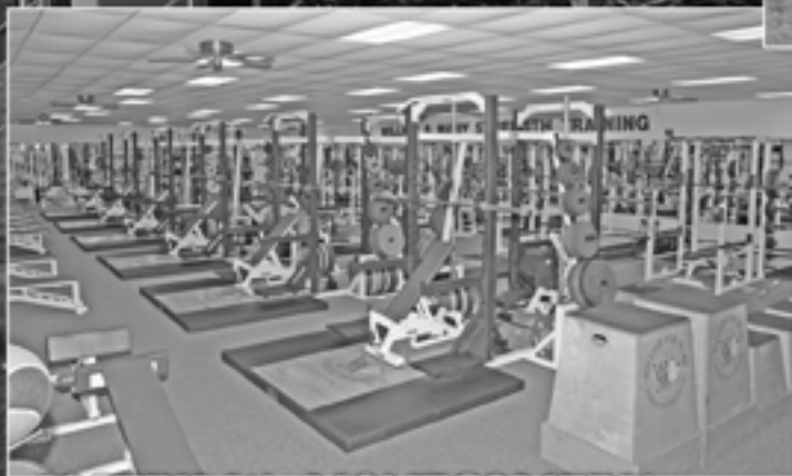
JOSEPH W. MONTGOMERY STRENGTH TRAINING CENTER