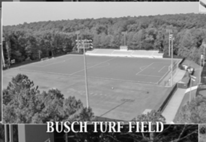
BUSCH TURF FIELD