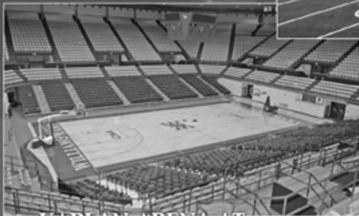
KAPLAN ARENA AT WILLIAM & MARY HALL