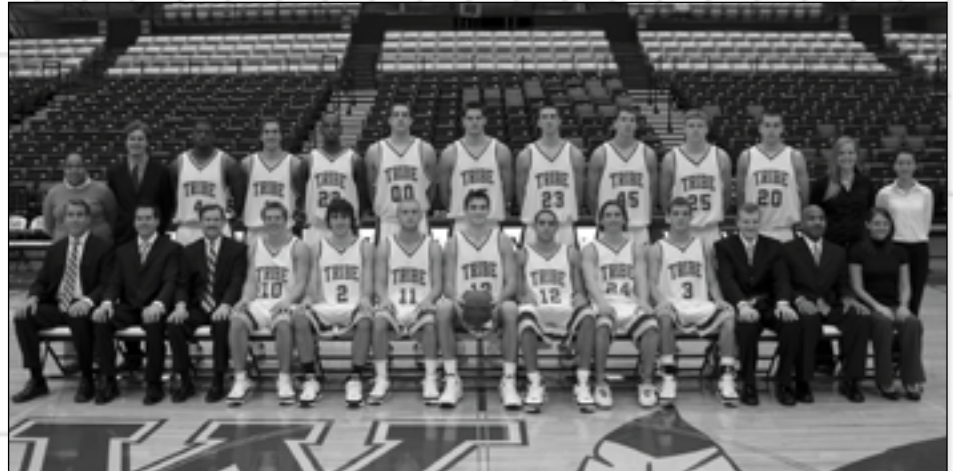
The 2007-08 William and Mary men's basketball team advanced to the programs first CAA Championship game and finished with 17 wins for only the sixth time in school history.

The Tribe not only set school records for 3-pointers made and attempted in 2007-08, but the College also topped the CAA records in both categories. W&M knocked down 257 treys on the year, bettering the old CAA record held by the 2006-07 Hofstra squad. The Green and Gold shattered the old school record, set just a season prior, by 57 3-