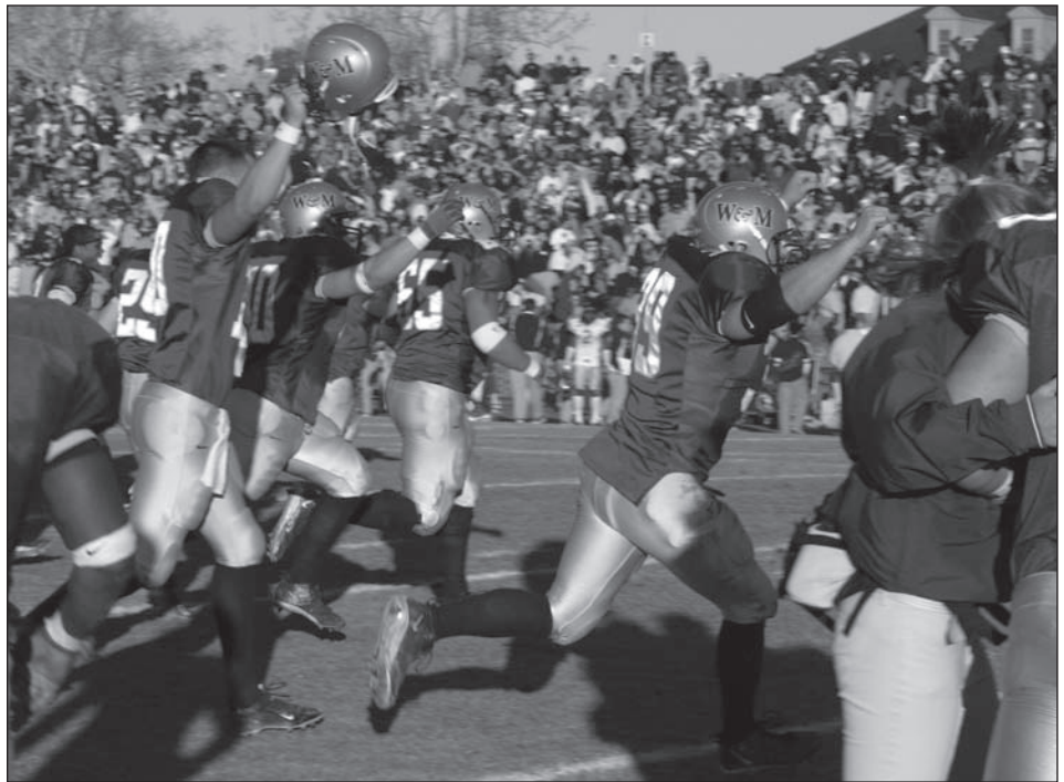
The Tribe storms the field after Saturday's thrilling 44-38 double-overtime victory over defending national champion Delaware at Zable Stadium.