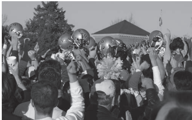
Students and Tribe fans join the on-field celebration Saturday.