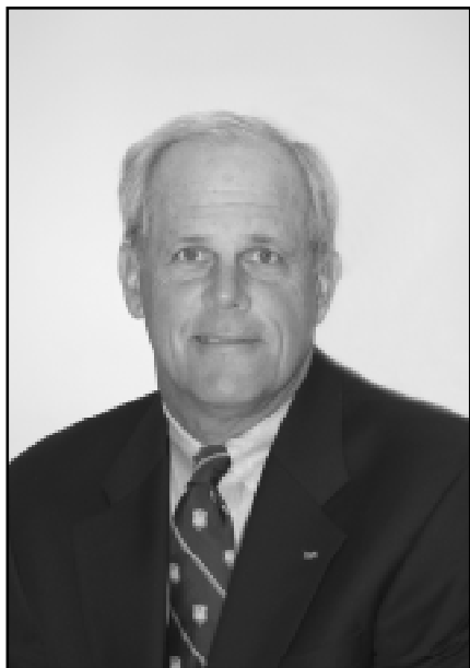
The Jimmye Laycock Era (1980 - present)