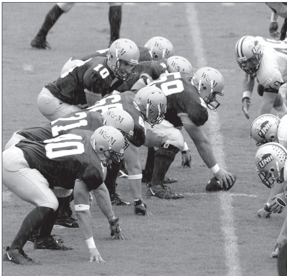
Behind the outstanding play of the offensive line, W&M powered out 190 rushing yards and scored on five of its six trips inside the red zone against New Hampshire.