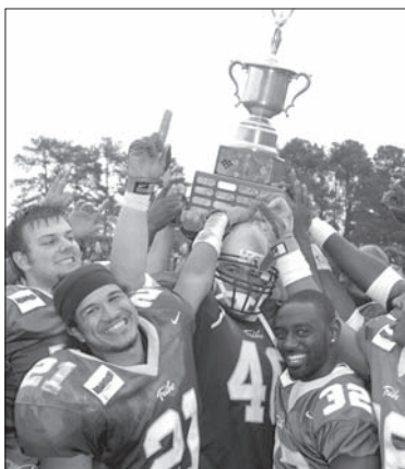
W&M retained the I-64 Trophy for a second-straight season after beating UR, 38-14, in the '04 regular season finale.