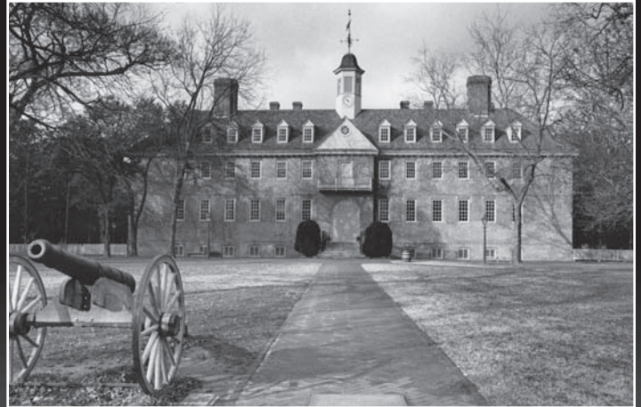
The Wren Building is the oldest one in the United States in which classes are still taught.

William and Mary was the first college to institute an honor code of conduct. The premier academic society, Phi Beta Kappa, was founded by William and Mary students in 1776. The Society of the Alumni, founded in 1842, is the sixth oldest alumni group in the nation. Now the College is designated as a "Public Ivy," and ranks 15th among the best regional business schools.