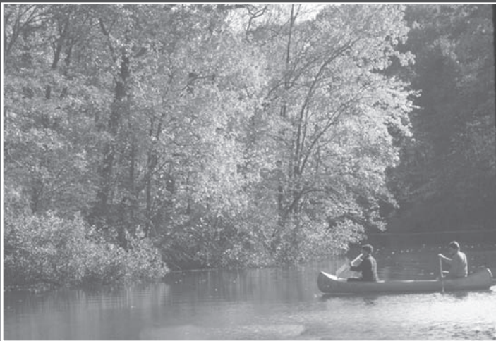
Lake Matoaka provides an on-campus field laboratory and recreational activities, and includes an amphitheatre to host concerts.