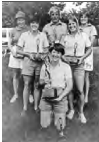
The 1981 AIAW Division II National Championship team.