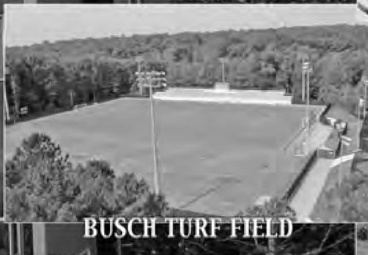
BUSCH TURF FIELD