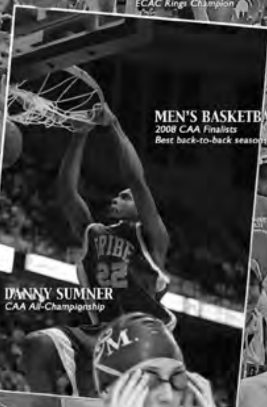
MEN'S BASKETBALL 2008 CAA Finalists Best back-to-back seasons in 25 years