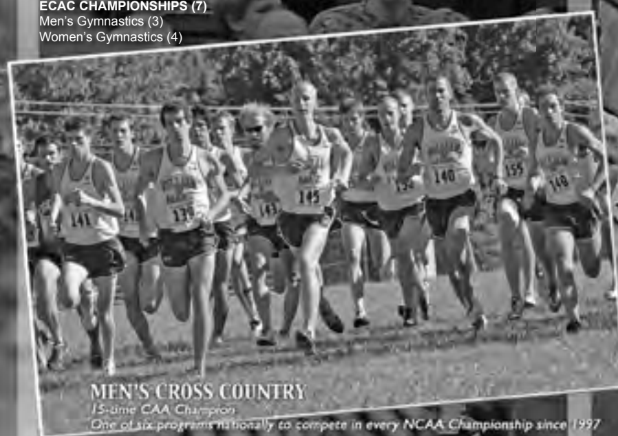
MEN'S CROSS COUNTRY 15-time CAA Champion One of six programs nationally to compete in every NCAA Championship since 1997