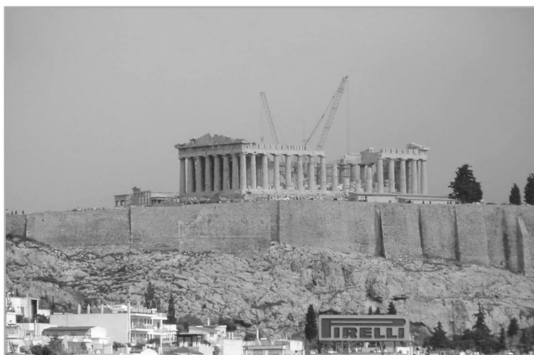
The W&M men's soccer team warms up prior to its match against Markopoulo during the 2003 Greece trip (Top). While in Greece, the Tribe saw a number of the country's historical landmarks (Center and Bottom).