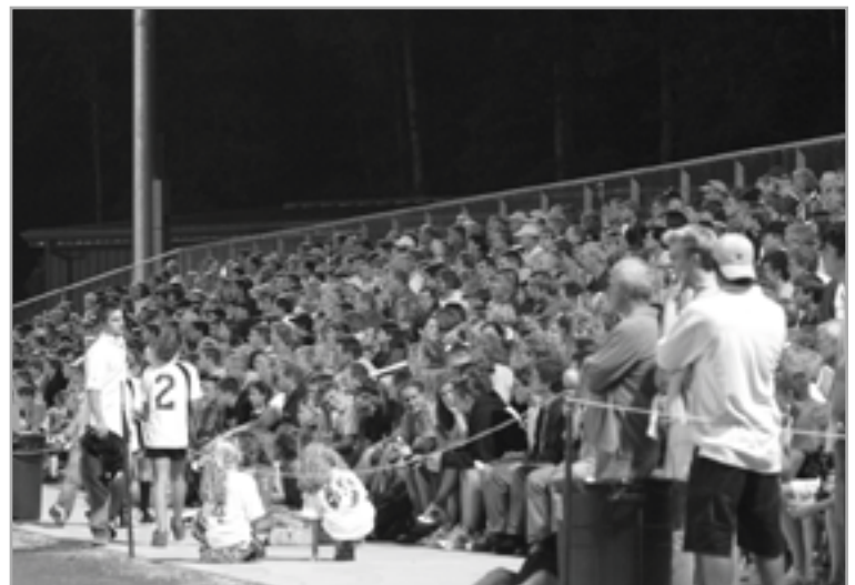
A crowd of 1,690 witnessed the Tribe upset then-No. 1 and eventual College Cup semifinalist Maryland, 1-0, on Sept. 22, 2004 in just the second game at Albert-Daly Field.