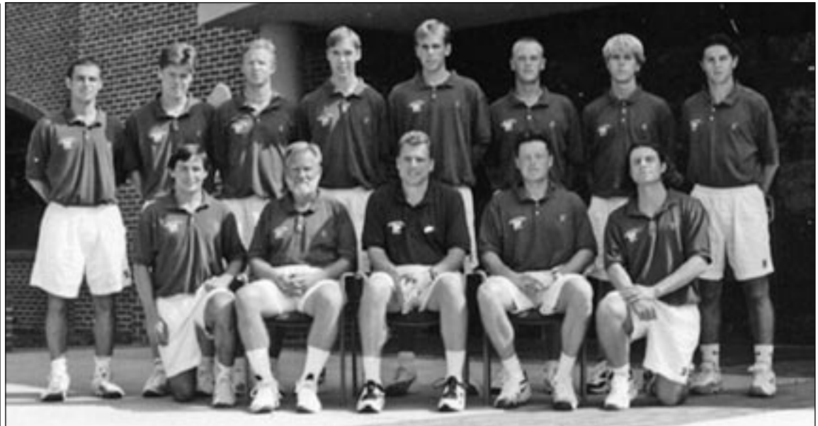
The 1999 men's tennis team earned an at-large berth into the NCAA Tournament, the first to do so since 1973. The Tribe has made nine trips to the NCAA Tournament including national titles in 1947 and 1948.