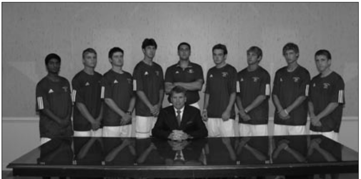
The 2005 William and Mary tennis team captured the program's third CAA Championship, defeating VCU in the finals, 4-2.

BEST SMALL PUBLIC UNIVERSITY IN NATION • RANKED 30TH OVERALL AMONG NATION'S BEST UNIVERSITIES • SECOND OLDEST COLLEGE IN AMERICA • HIGHEST RANKED NCAA DIVISION I PUBLIC SCHOOL IN 2004 APR