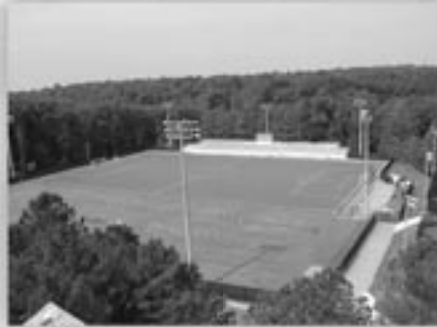
Busch Turf Field