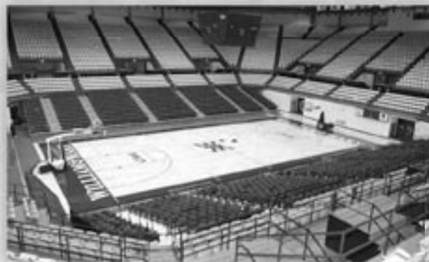
Kaplan Arena at William and Mary Hall