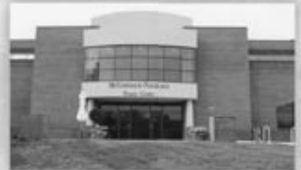
McCormack-Nagelsen Tennis Center