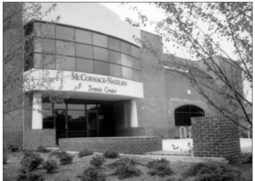
Mark McCormack provided the funding for the McCormack-Nagelsen Tennis Center, one of the finest indoor college tennis facilities in the nation.