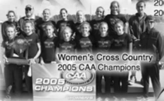
Women's Cross Country 2005 CAA Champions