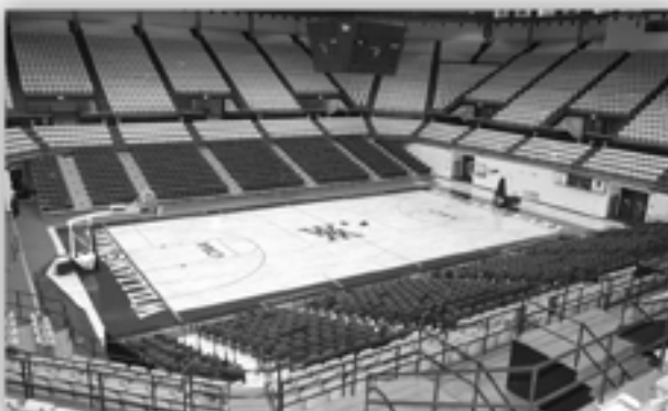
Kaplan Arena at Willan and Mary Hall