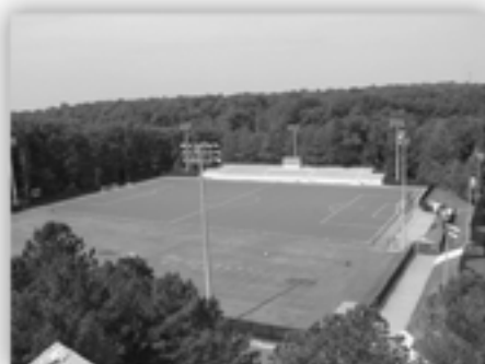
Busch Turf Field