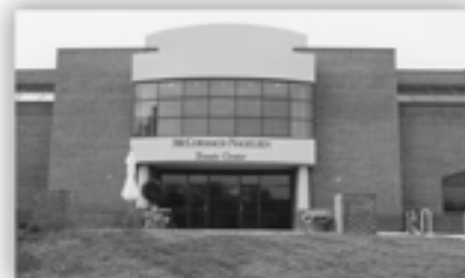
McCormack-Nagelsen Tennis Center