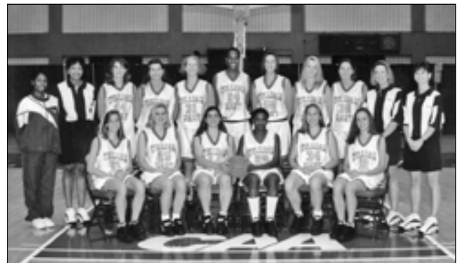
2001-02 William and Mary Tribe

1258, 1980-1981 (32) 1201, 2006-2007 (31) 1161, 1993-1994 (28) 1143, 1981-1982 (28) 1134, 1984-1985 (27) 1133, 1994-1995 (29) 1133, 1990-1991 (27) 1127, 2001-2002 (29) 1126, 1992-1993 (28) 1124, 1988-1989 (27) 1120, 1991-1992 (27) 1110, 1983-1984 (27) 1108, 1989-1990 (27) 1092, 2005-2006 (28) 1083, 1982-1983 (25) 1072, 1987-1988 (27) 1066, 2000-2001 (29) 1042, 1985-1986 (27) 1040, 1998-1999 (27) 1039, 1986-1987 (27) 1034, 1999-2000 (27) 1010, 2002-2003 (28) 1009, 1995-1996 (27) 1001, 1996-1997 (27) 993, 2003-2004 (29) 974, 1979-1980 (25) 970, 1997-1998 (27) 946, 1977-1978 (22) 940, 2004-2005 (28) 838, 1978-1979 (29)