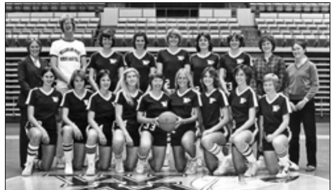
1980-81 William and Mary Tribe

709, 1980-1981 (32) 684, 2001-2002 (29) 667, 1990-1991 (27) 660, 1998-1999 (27) 650, 1991-1992 (27) 637, 1993-1994 (28) 615, 1997-1998 (27) 584, 1995-1996 (27) 583, 2003-2004 (29) 567, 1999-2000 (27) 566, 2006-2007 (31) 566, 1989-1990 (27) 560, 1981-1982 (28) 536, 1984-1985 (27) 535, 2000-2001 (29) 530, 1988-1989 (27) 525, 2002-2003 (28) 513, 1986-1987 (27) 512, 1982-1983 (25) 509, 1992-1993 (28) 505, 1985-1986 (27) 504, 1996-1997 (27) 503, 1994-1995 (29) 480, 1983-1984 (27) 477, 1987-1988 (27) 476, 1979-1980 (25) 468, 2005-2006 (28) 467, 2004-2005 (28) 458, 1978-1979 (29) 377, 1977-1978 (22)