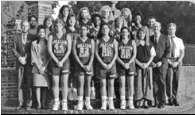
1990-91 William and Mary Tribe