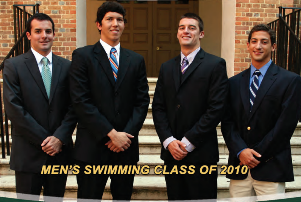
MEN'S SWIMMING CLASS OF 2010