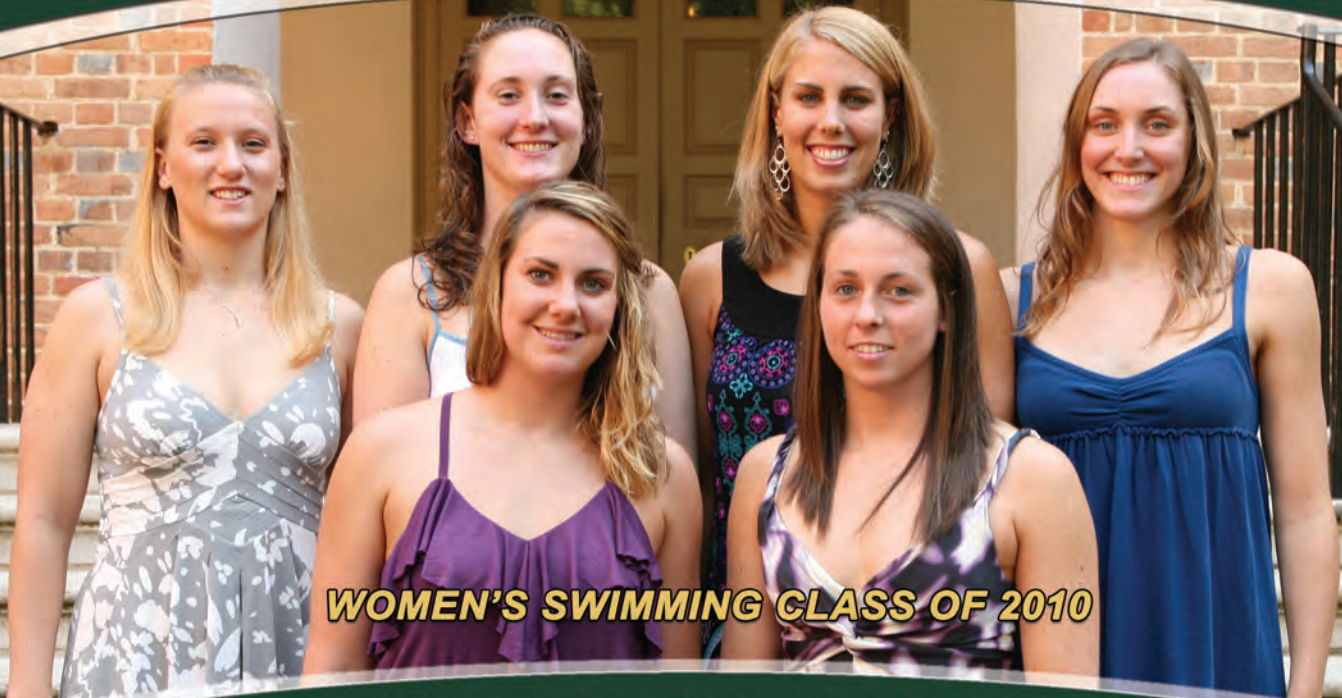
WOMEN'S SWIMMING CLASS OF 2010