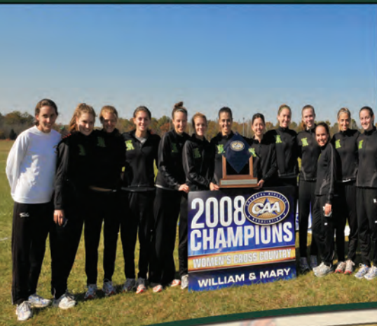
2008 CAA CHAMPIONS WOMEN'S CROSS COUNTRY WILLIAM & MARY