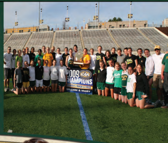
2009 CAA CHAMPIONS WOMEN'S CROSS COUNTRY WILLIAM & MARY