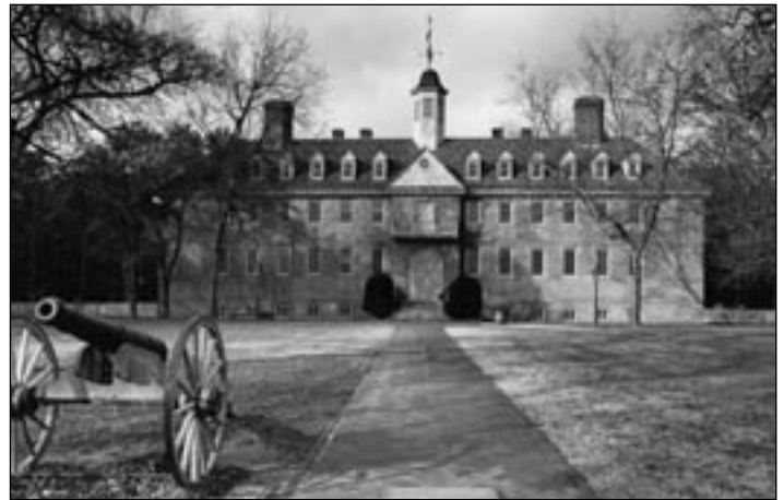
The Wren Building is the oldest one in the United States in which classes are still taught.

William and Mary was the first college to institute an honor code of conduct. The premier academic society, Phi Beta Kappa, was founded by William and Mary students in 1776. The Society of the Alumni, founded in 1842, is the sixth oldest alumni group in the nation. Now the College is designated as a "Public Ivy", and ranks 15th among the best regional business schools.