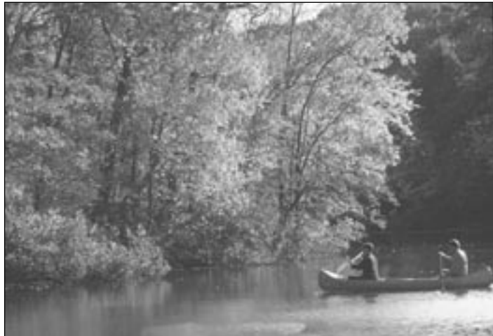
Lake Matoaka provides an on-campus field laboratory and recreational activities, and includes an amphitheatre to host concerts.

In addition to the historic Williamsburg setting of the College, there are many other attractions offered within a reasonable driving distance from campus. W&M is located within three hours of Washington, D.C. Whether you like surfing at Virginia Beach (one hour away) or skiing at Massanutten (less than three hours away), there is something for everyone in the W&M vicinity.