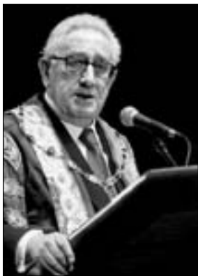
Henry A. Kissinger Chancellor

Soldier, statesman, academician, author, peacemaker Henry A. Kissinger was installed February 10, 2001, as the 22nd Chancellor of the College of William and Mary. The former U.S. Secretary of State and Nobel Peace Prize winner also delivered the Charter Day address. Mr. Kissinger, who succeeded Margaret, The Lady Thatcher, as chancellor was