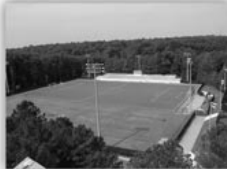
Busch Turf Field