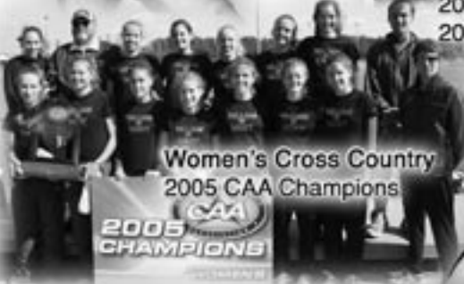
Women's Cross Country 2005 CAA Champions