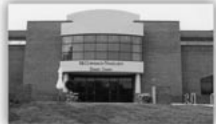
McCormack-Nagelsen Tennis Center