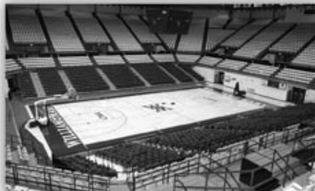
Kaplan Arena at William and Mary Hall