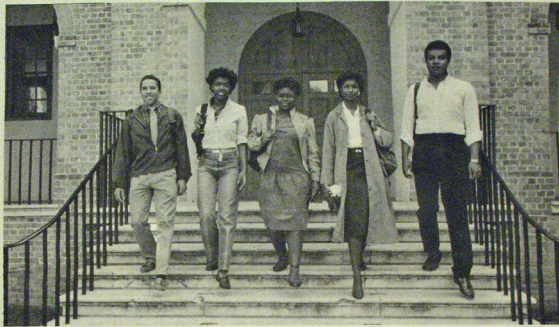
At William and Mary, "commitment" is the key word in the College's emphasis on attracting young black men and women and helping them realize the College's potential as well as their own.