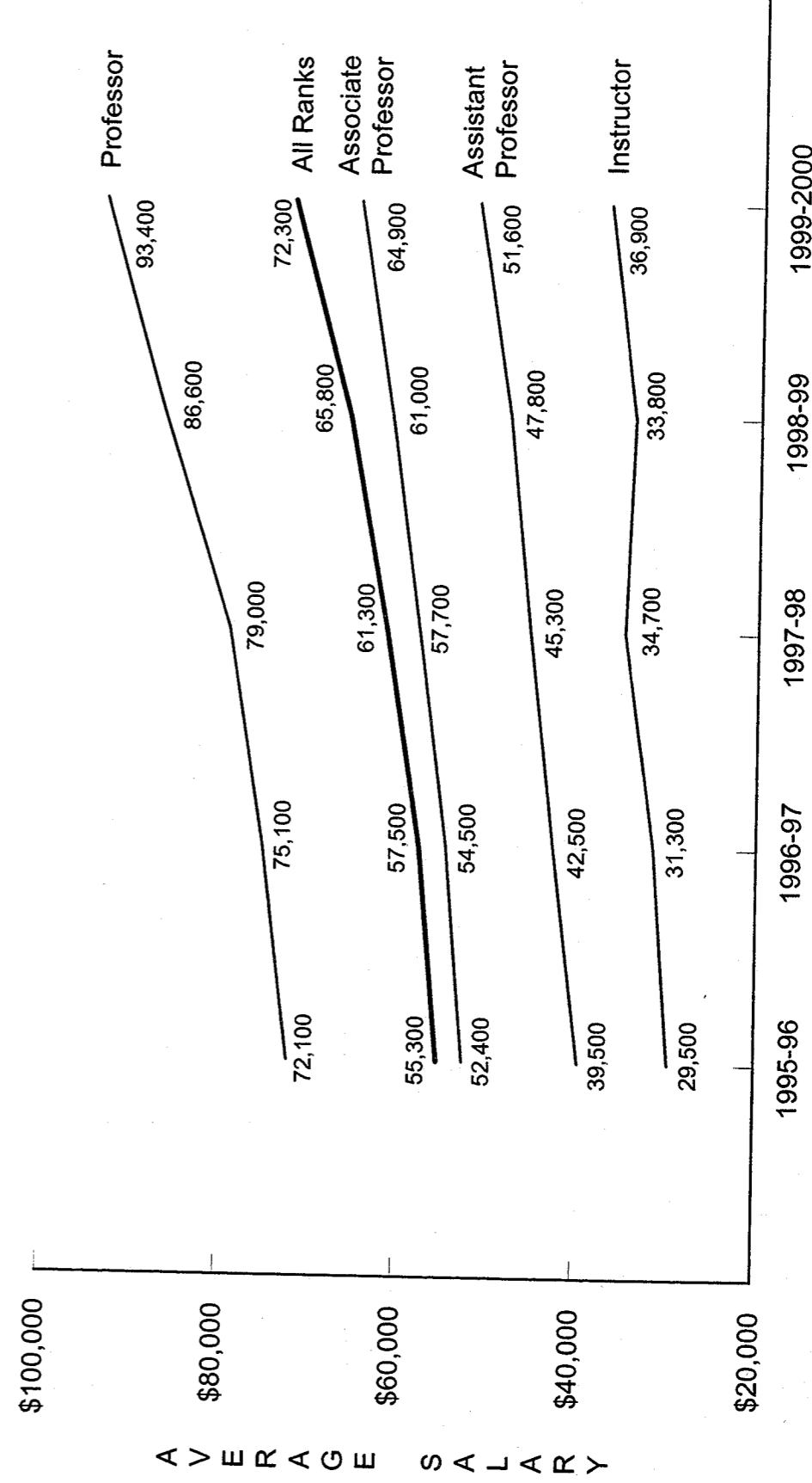
Table 55: Average Salary of Full-Time Instructional and Research Faculty by Rank 1995-96 through 1999-2000

Note: This chart includes all instructional and research faculty on the payroll as of October 1 of each academic year. Salaries reflect increases effective December 1 of each academic year and have been converted to a nine-month basis.