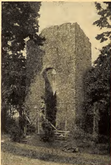
OLD CHURCH TOWER

The upper part of Jamestown Island is now under the care of the Association for the Preservation of Virginia Antiquities. Within this area the most important artificial landmark is the tower of the Old Church. Numerous relics of great historical interest have been preserved, chief among these being the foundations of the original State House which have been carefully excavated and marked in accordance with the exact dimensions of the original building. Several memorials have been erected: the Memorial Church, a restoration presented by the National Society of the Colonial Dames of America; a bronze statue of John Smith, unveiled in 1909; a bronze statue of Pocahontas, an exceptionally beautiful work, unveiled in 1922, and set at one end of a grassy amphitheatre; the Memorial Shrine to Robert Hunt, the first minister of Jamestown Church.