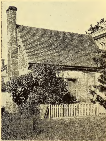
POOR DEBTORS' PRISON

THE GOVERNOR’S PALACE. The Governor’s House, or Palace, was built in 1705-10, its immediate site being that at the north end of Palace Green. As described by the Reverend Hugh Jones in 1723, it was a “magnificent structure.” Until the Revolution this was the home of the royal governors, chief among whom were Alexander Spotswood who led the “Knights of the Golden Horseshoe” on the first ultra-montane expedition in the history of the colony; Robert Dinwiddie, under whom the youthful Washington was sent to the French governor at Fort