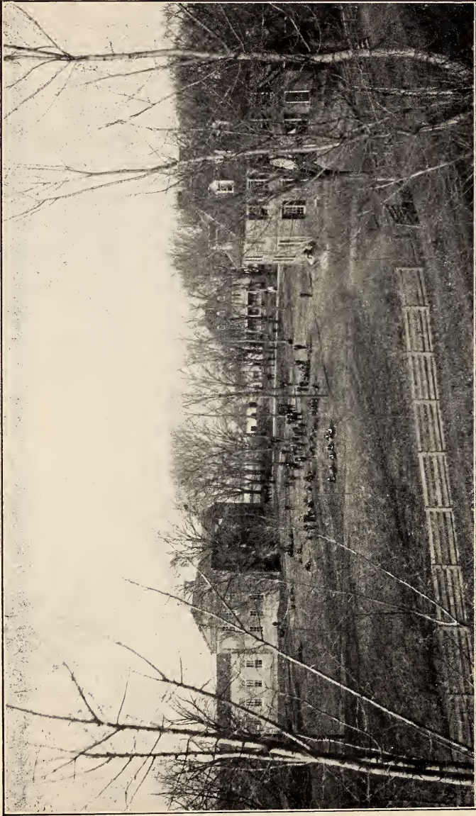
College of William and Mary.