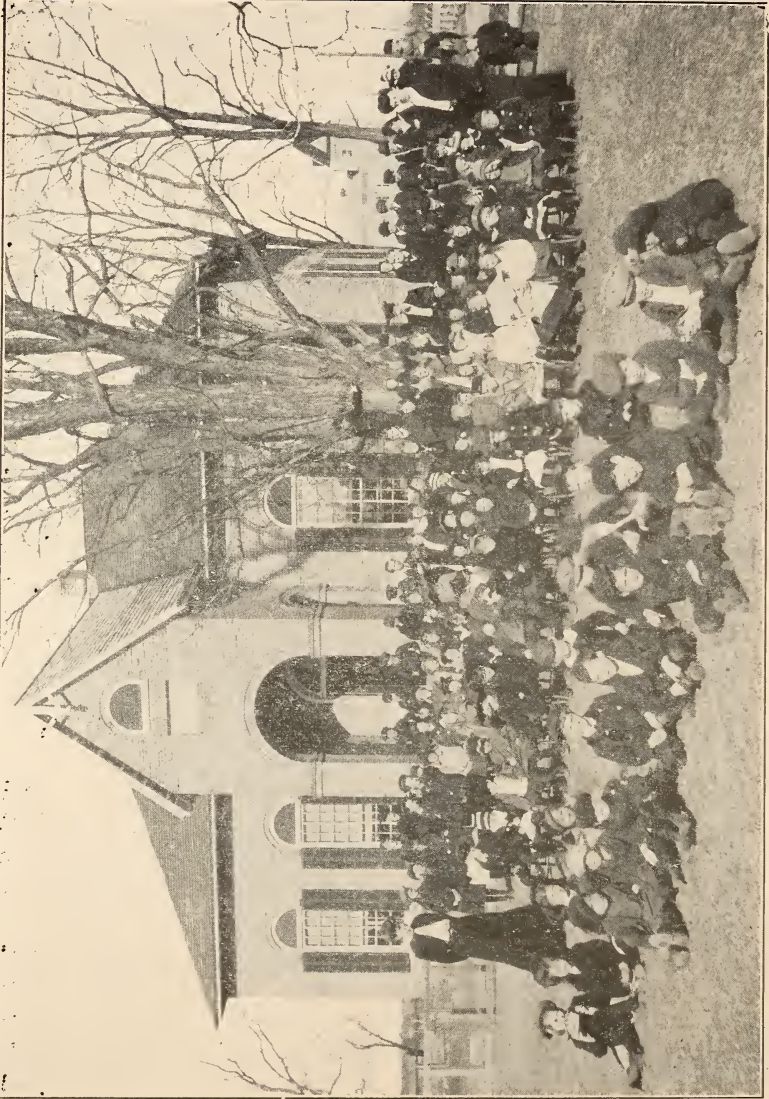
Mattey's Observation and Training School.