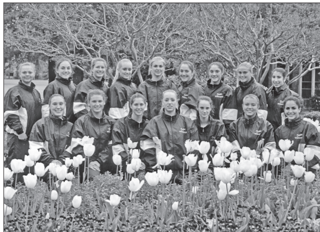
The 1999 team recorded 16 head-to-head victories and won the first of the program's four ECAC titles.