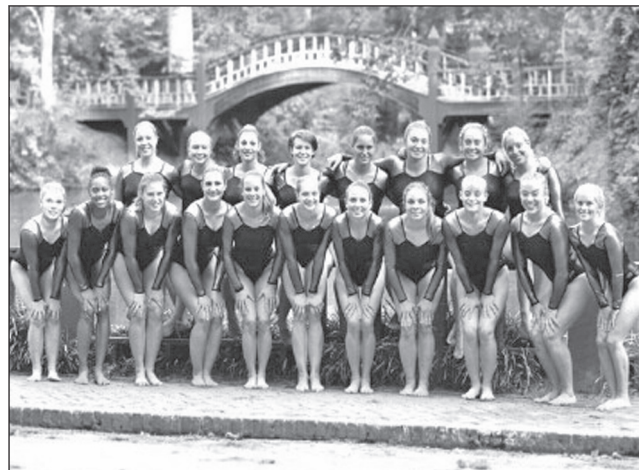
The 2003 squad posted the highest team score in school history (195.450) en route to winning an ECAC title.