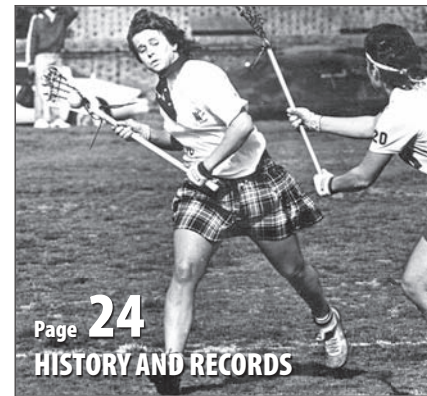
Page 24 HISTORY AND RECORDS