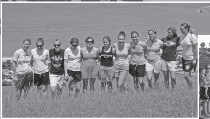
(Above) W&M's 10-day visit to Australia included six days in Melbourne and four days in Sydney. The College has already begun its fundraising drive for the 2012 international trip.