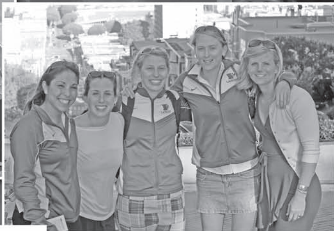
(Below) The Tribe players had a chance to sightsee downtown San Francisco during their trip to the Bay area during the '07 season.