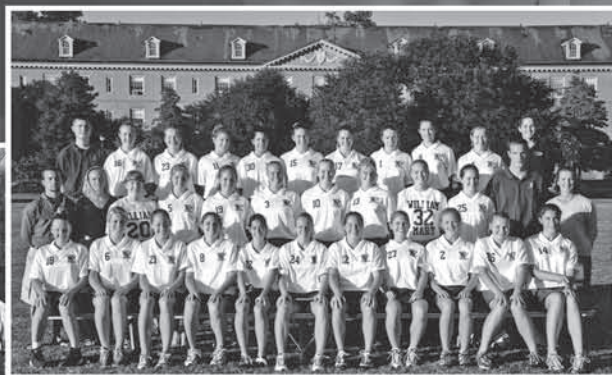
(Above) With regular-season triumphs against Virginia and Johns Hopkins, the 2001 Tribe team earned an NCAA Tournament bid.