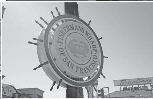
(Below) The Tribe dined at the world-famous Fisherman's Wharf of San Francisco during the '07 California trip.