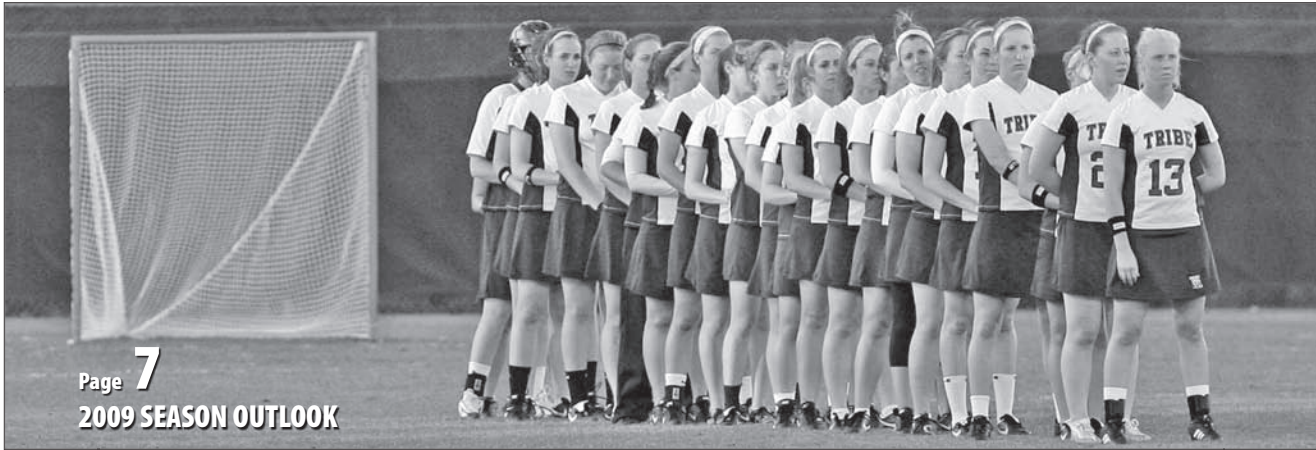
Page 7 2009 SEASON OUTLOOK