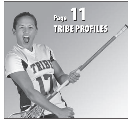
Page 11 TRIBE PROFILES

2008 Record: 10-9 2008 CAA Record/Finish: 5-2/T-First Players Returning/Lost: 19/4 Newcomers: 8 NCAA Tournament Appearances: 7 USWLA Nat'l Tournament Appearances: 2