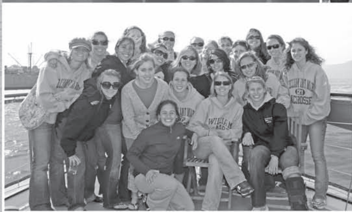
(Above) The Tribe huddles together for a group photo during a yacht cruise on the San Francisco Bay.