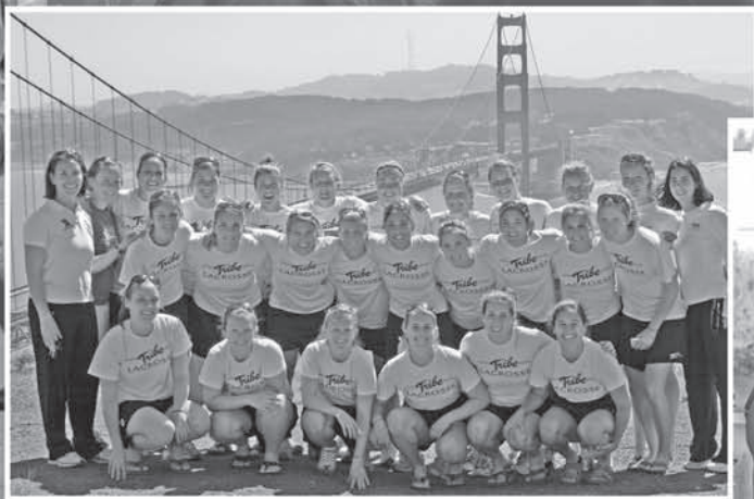
(Above) The '07 W&M lacrosse squad takes a break to pose for a team photo in front of the Golden Gate Bridge.

A blog entry from last season's trip to Australia can be found on the next page.