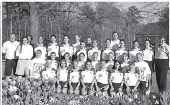
(Below) In addition to recording victories at Duke and North Carolina, the 1996 Tribe squad posted a 5-1 CAA mark en route to earning an NCAA Tournament at-large bid.

(Above) The game program from the Tribe's 1997 NCAA Quarterfinal game at Loyola. W&M posted a 5-1 mark in CAA play that season while earning non-conference wins against Duke, Georgetown and Penn State.