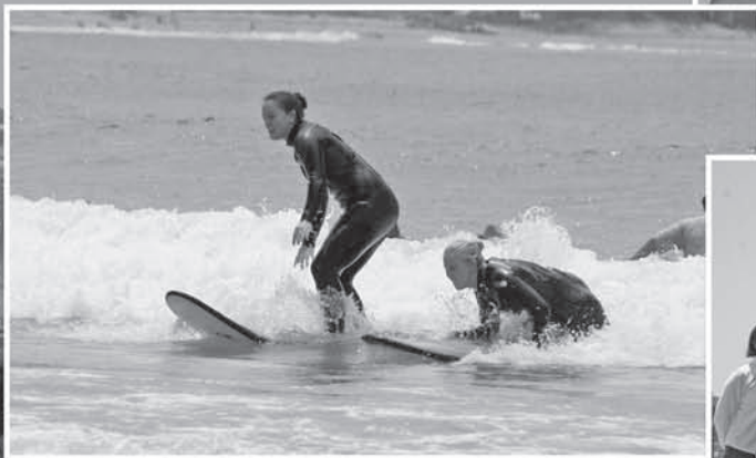
(Above) Among the many memorable experiences during the trip to Australia was the surfing in Melbourne.