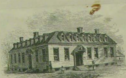
THE OLD SALEM TAVERN