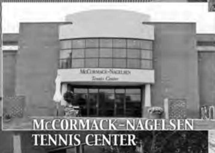
MCCORMACK-NAGELSEN TENNIS CENTER