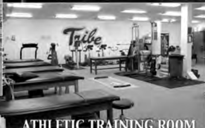
ATHLETIC TRAINING ROOM