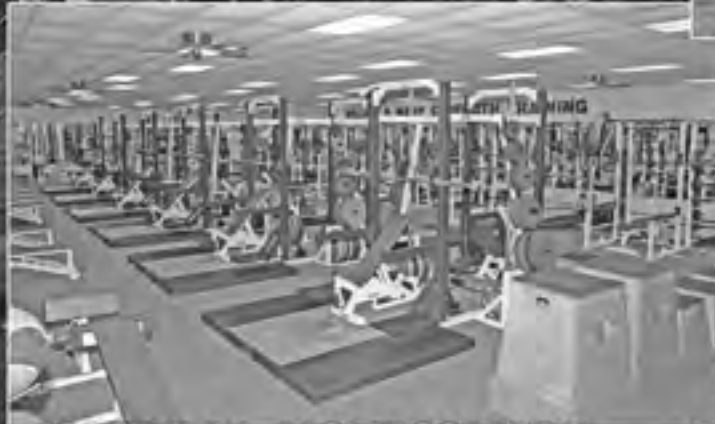
JOSEPH W. MONTGOMERY STRENGTH TRAINING CENTER