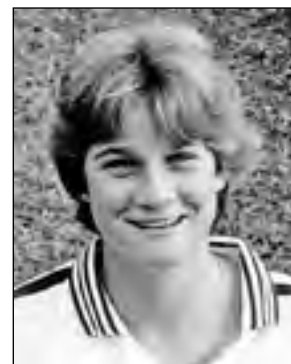
Jill Ellis 1987