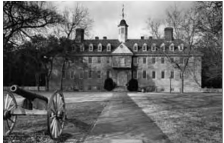
The Wren Building is the oldest one in the United States in which classes are still taught.

William and Mary was the first college to institute an honor code of conduct. The premier academic society, Phi Beta Kappa, was founded by William and Mary students in 1776. The Society of the Alumni, founded in 1842, is the sixth oldest alumni group in the nation. Now the College is designated as a "Public Ivy", and ranks 15th among the best regional business schools.