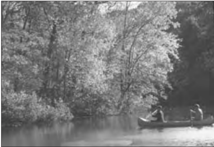
Lake Matoaka provides an on-campus field laboratory and recreational activities, and includes an amphitheatre to host concerts.