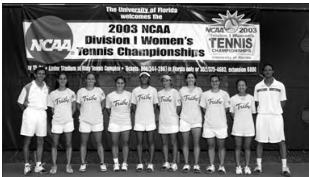
In 2003, W&M reached the Sweet Sixteen of the NCAA Tournament for the fifth time in nine years.