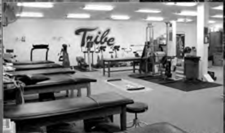
ATHLETIC TRAINING ROOM