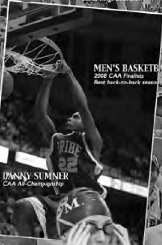
MEN'S BASKETBALL 2008 CAA Finalists Best back-to-back seasons in 25 years