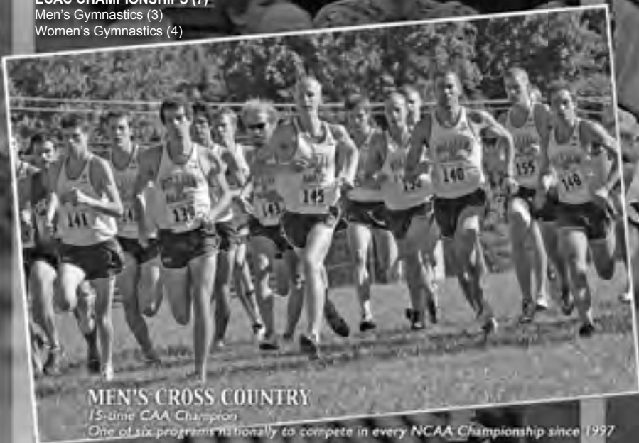
MEN'S CROSS COUNTRY

2007 CAA Champions Ranked No. 6 in final CollegeSwimming.com Mid-Major Power Poll