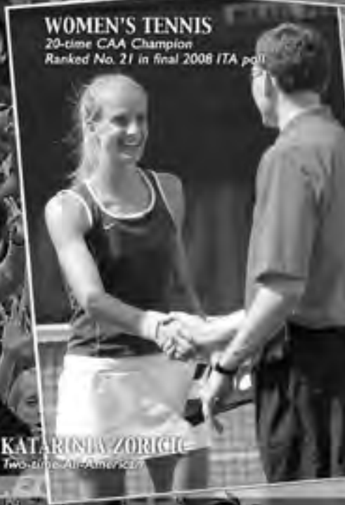
WOMEN'S TENNIS 20-time CAA Champion Ranked No. 21 in final 2008 ITA poll