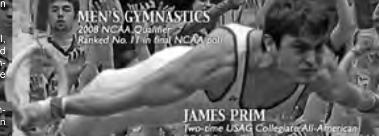
MEN'S GYMNASTICS 2008 NCAA Qualifier Ranked No. 11 in final NCAA poll