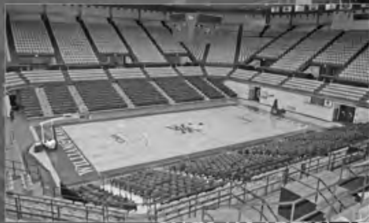
KAPLAN ARENA AT WILLIAM & MARY HALL

William and Mary is committed to building and maintaining outstanding facilities for all 21 of its varsity athletic teams. The College has demonstrated this commitment by investing approximately $16 million toward the construction and upgrade of its athletics facilities during just the last five years. Among W&M's recent projects was the construction of the $11 million, 30,000-square foot Jimmie Laycock Football Center, which was dedicated this past June. In recent years, the College has hosted NCAA tournament events for football and women's tennis, while a number of other W&M programs have hosted conference championships at Tribe venues.