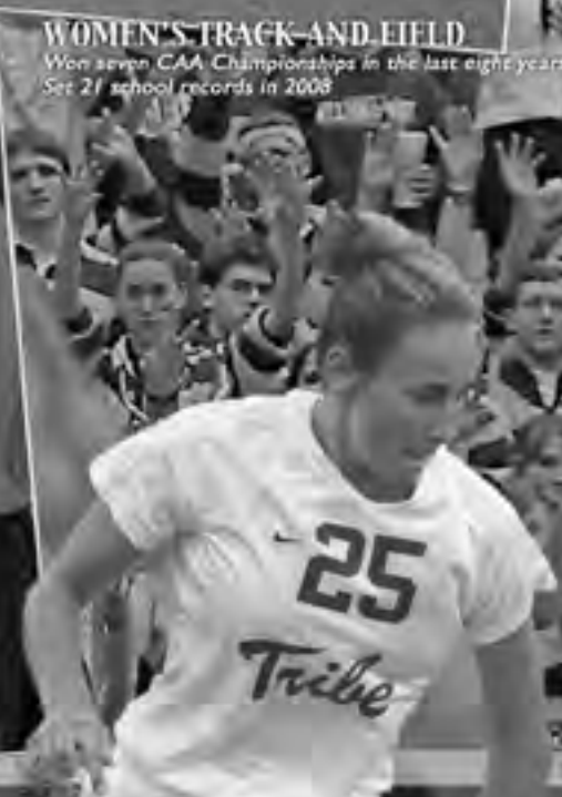
WOMEN'S TRACK AND FIELD Won seven CAA Championships in the last eight years Set 21 school records in 2008