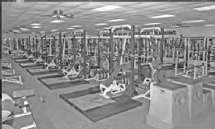
JOSEPH W. MONTGOMERY STRENGTH TRAINING CENTER