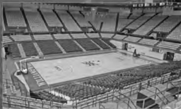
KAPLAN ARENA AT WILLIAM & MARY HALL

William and Mary is committed to building and maintaining outstanding facilities for all 21 of its varsity athletic teams. The College has demonstrated this commitment by investing approximately $16 million toward the construction and upgrade of its athletics facilities during just the last five years. Among W&M's recent projects was the construction of the $11 million, 30,000-square foot Jimmie Laycock Football Center, which was dedicated this past June. In recent years, the College has hosted NCAA tournament events for football and women's tennis, while a number of other W&M programs have hosted conference championships at Tribe venues.