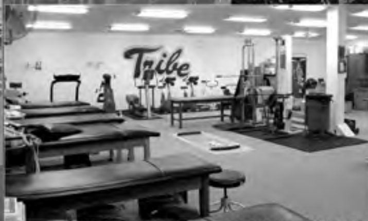
ATHLETIC TRAINING ROOM